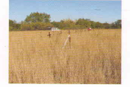
Poor fence maintenance